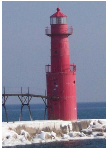
Algoma Pierhead Lighthouse near Green Bay, Wisconsin.

The lighthouse is in Bay Shore, New York. Bob's hometown is on Long Island, NY; so this lighthouse replica will be placed on the Arizona side of the lake. A site has yet to be determined.