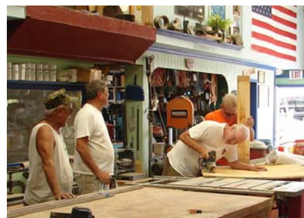
Lighthouse Club members working on the White Shoals Lighthouse.

The Lighthouse Board would have preferred a permanent light station, but it was decided that lightships would answer the problem much sooner. Three lightships were built to protect shipping from White Shoal, Simmons Reef and Grays Reef the three areas needing immediate attention. The lightships were completed and turned over to the Lighthouse Service on September 15, 1891 and designated LV55, LV56, and LV57. The lightships served as an immediate solution to the problem, but because of problems getting